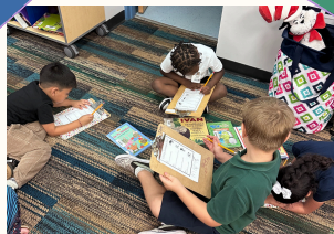
Kindergarten Library Book scavenger Hunt