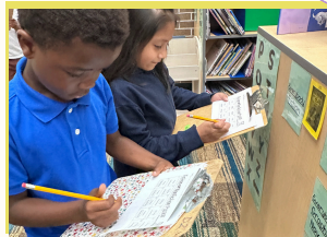
2 nd Grade Fiction / Nonfiction scoot