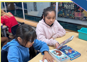
5th grade Literary Genre Detectives

BRBB will begin in October. Invitations will be going home within the next week. We will meet during 3 rd , 4 th and 5 th grade lunch time on Wednesdays. There are four exciting books the boys will be reading this year.